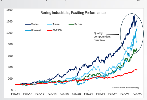
chart shows the extent to which these companies outperformed the US market over the past ten years.

and heating equipment; Howmet, provider of engineered materials for aviation; and Parker Hannifin, which makes aerospace systems. This